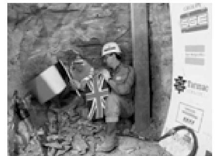
Breakthrough of service tunnel on 1 December 1990 (Eurotunnel)