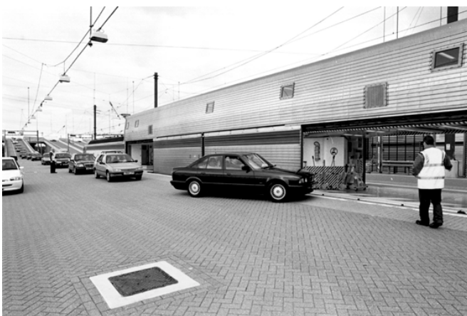
Loading passenger shuttle at Folkestone and Coquelles (right)

The passenger shuttles are 776-m long and their vehicles are the largest in the railway world. Each shuttle comprises two rakes—12 double-deck wagons for cars, and twelve single-deck wagons for coaches caravans and other high-sided vehicles. Customers drive their vehicles into special loader wagons at the rear of each rake and continue through the body of the train until told to stop by a member of the crew. During transit through the tunnel, fire-resistant doors between the wagons are closed. Passengers stay in their vehicles during the 35-minute journey to the other terminal. A unique feature of the shuttle system is that British outward and French inward border controls are carried out in Folkestone (the reverse occurs on the return journey). This means that on arrival at the other terminal, customers can drive directly onto the motorway with no further controls. The shuttle locomotives, which are used for both passenger and freight services, are among the most powerful in the world. They produce 5.6 MW (7500 hp) and can