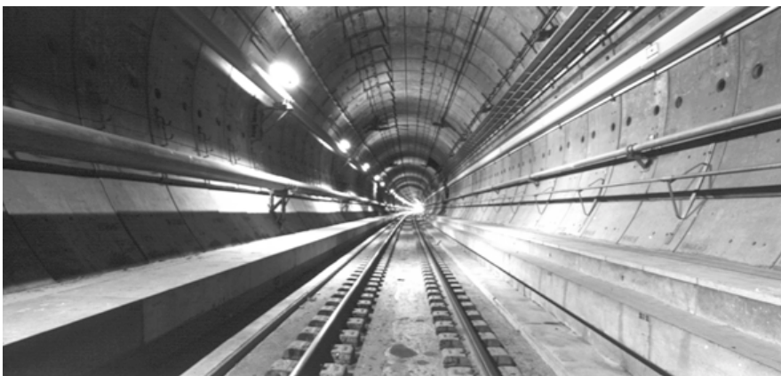
One of running tunnels