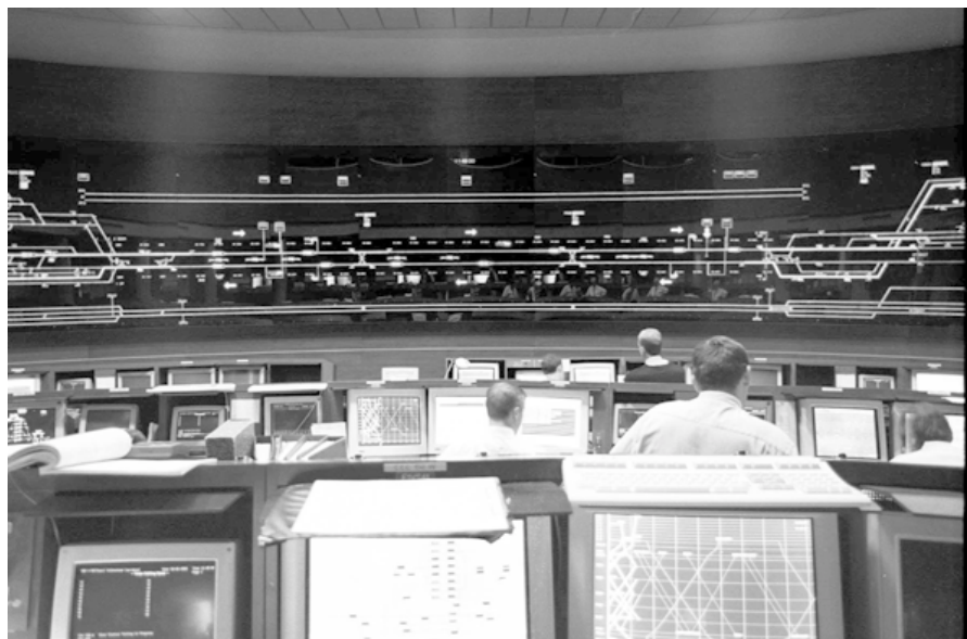
Railway control centre at Folkestone

The presently available number of standard paths in each direction is 20 per hour, and about two-thirds of this capacity is already