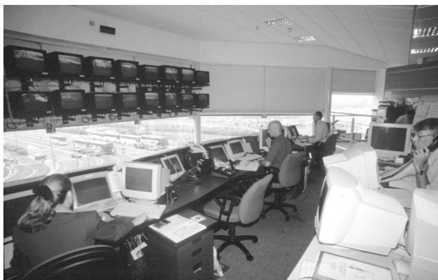
Terminal traffic control centre at Folkestone