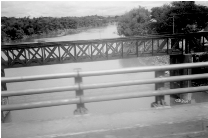
The rails have long since been removed by scavengers on this bridge in Plaridel, Bulacan on the abandoned line from Balagtas to Cabanatuan. Plaridel is about 12 km from Balagtas.

Meanwhile, Region 2, which is outside the zone, has the second lowest road density in the country. CEZA's Final Report recognizes this challenge by saying, 'Due to this perceived lack of efficient road systems, the region has difficulty attracting private sector investments because of