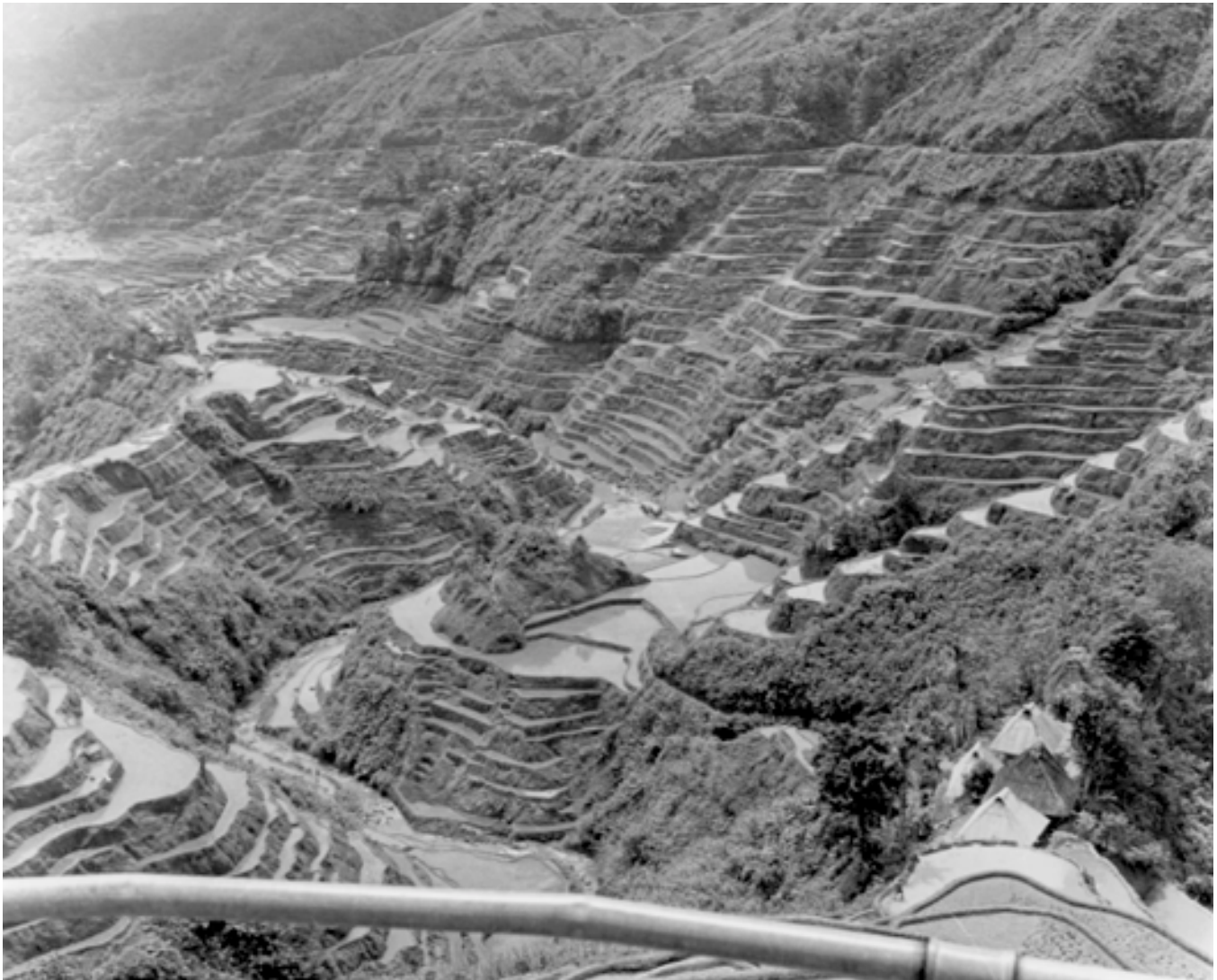
Tourism to the world-famous Banawe Rice Terraces is the main reason for building the Ifugao branch line to Banawe.