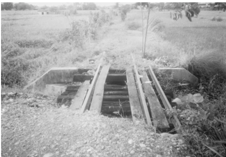
This is a trace of the abandoned Tarlac–San Jose branch line a short distance from the Maharlika Highway in San Jose City, Nueva Ecija.