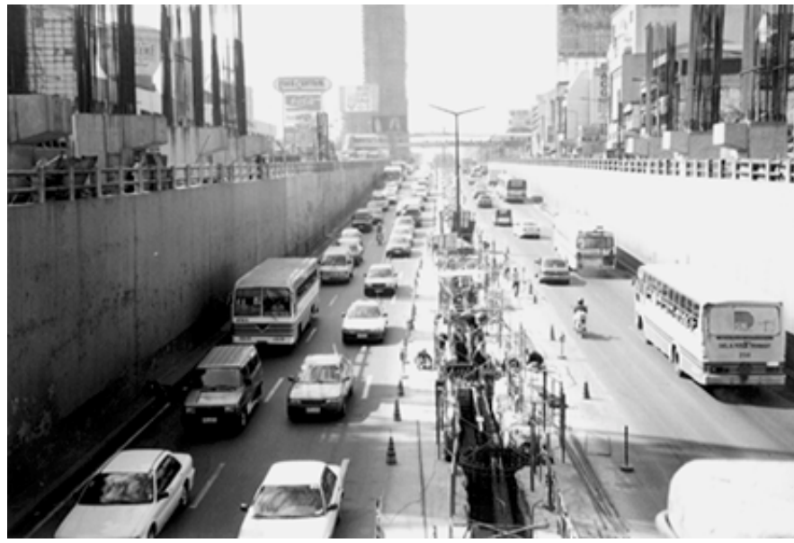
Looking south from Shaw Boulevard overpass on LRT Line 3 with part of EDSA straddled by station support columns (EDSA MRT Project)

The government-owned Construction Development Corporation of the Philippines (now the Philippine National Construction Corp.) was the sole contractor for the project. One reason for choosing the north-south Monumento-Baclaran route was because it is fairly straight for most of its length. Nonetheless, there were obstacles to overcome including a 5-year-old high rise department store and a classroom building at nearby Feati University. Both were torn down to make way for Carriedo Station and the tracks going to the Pasig River bridge, the very last section to be built. The north and south sections were not connected for about 5 months until they were linked on 12 May 1985. After an absence of almost 40 years, the tranvia was back. Meralco was also back in the transport business, albeit just for 10 years because the Meralco subsidiary that operated Metrorail is now completely controlled by the Light Rail Transit Authority.