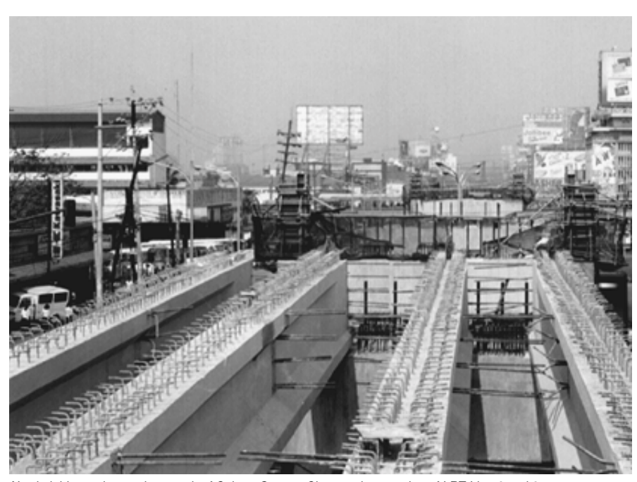
Newly-laid crossbeams just south of Cubao, Quezon City near intersection of LRT Line 2 and 3 (EDSA MRT Project,

LRT Line 4, another east-west route from Manila to Quezon City, is just over the planning horizon. It will follow España, Quezon Ave., and Commonwealth for 22