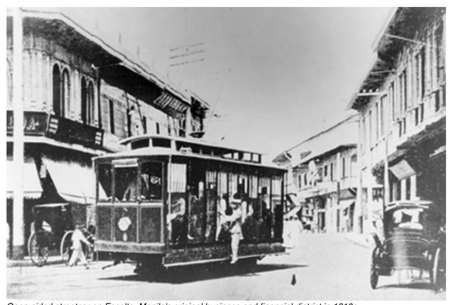
Open-sided streetcar on Escolta, Manila's original business and financial district in 1910s

The Philippine Commission on 20 October 1902 passed a law that set into motion franchises to be awarded to bidders for the construction and operation of