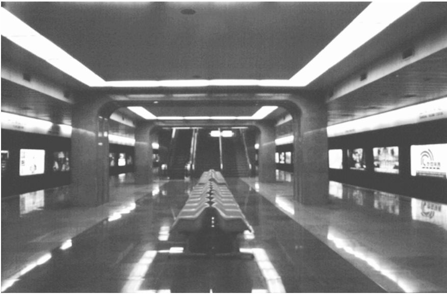
Shanghai Railway Station