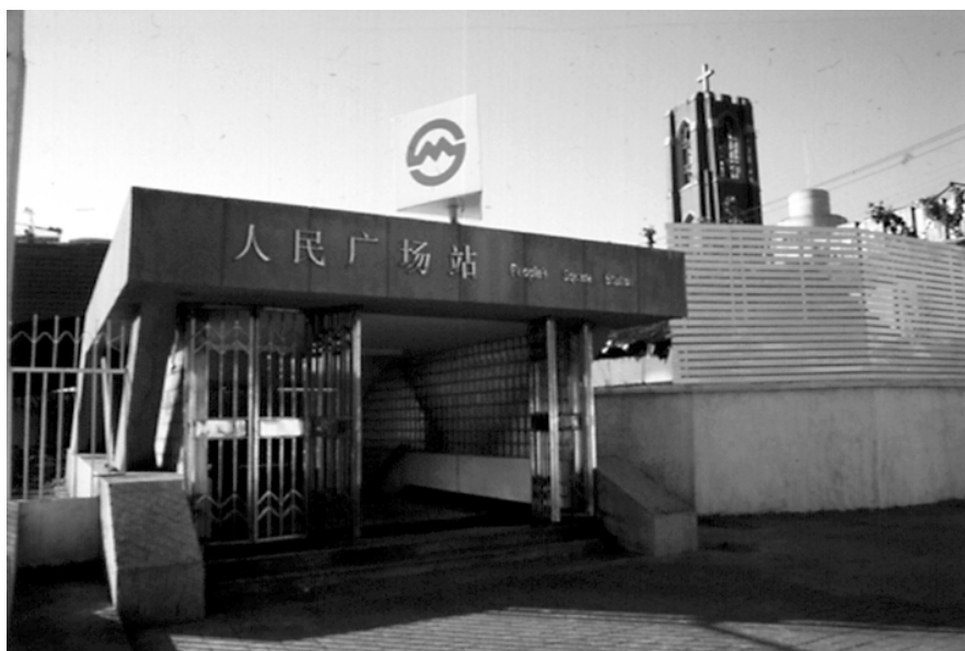
People's Square Station

The environment control system was fully installed, tested and fine-tuned by 12 December 1994. It maintains the quality of the environment in the tunnels and