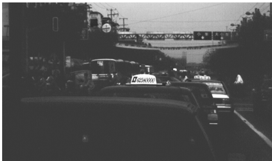
Different Type of Traffic Congestion in Shanghai