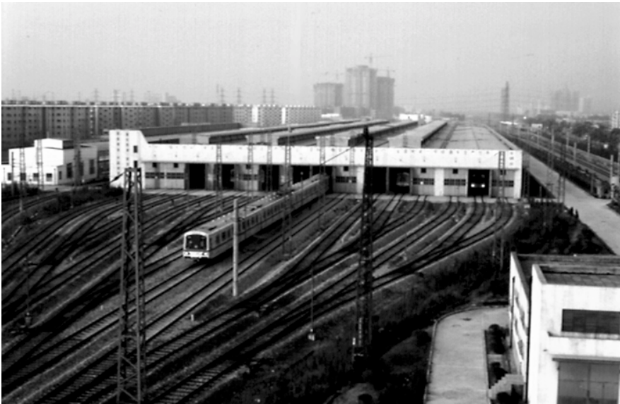
Shanghai No. 1 Line Depot