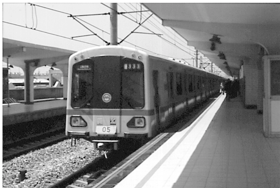
Xin Long Hua Station

The average underground station on the No. 1 Line is 230-m long and between 20- and 24-m wide. Each station has two levels. The upper level is devoted to the station hall, with three to five entrances/exits leading to the street above. The hall contains ticket machines, wickets and public telephones. The lower level is devoted to the platforms and tracks. The