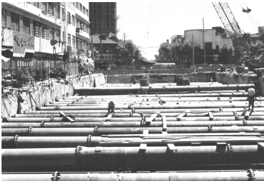
Cut and Cover Construction of Shanghai No. 1 Subway Line

The General Company was under the supervision of the Shanghai City Engineering Management Bureau, which in turn was under the Shanghai City Construction Committee Group. The Board of Directors and the General Company were in fact two names for one body responsible for public bidding on projects, signing contracts, and smoothing relationships; this unitary group was divided into two separate entities like two sides of the same coin to reflect both government and corporate functions. The General Company brought together more than 40 companies and construction units to work on the project through public bidding.