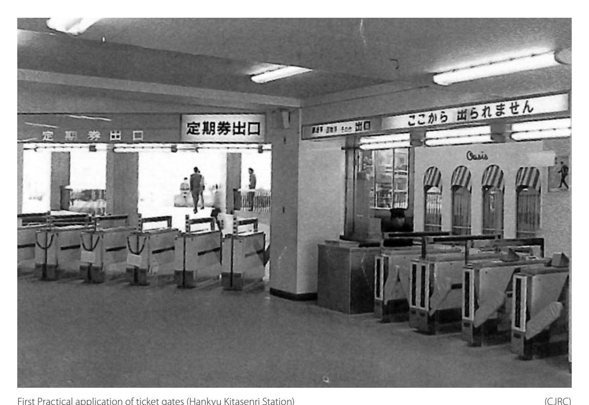
First Practical application of ticket gates (Hankyu Kitasenri Station)

as in standardization and dissemination of ticket systems in Japan.