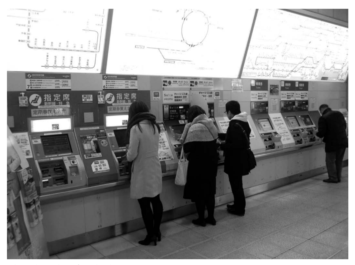
Ticket vending machines of typical medium station (Asagaya Station)