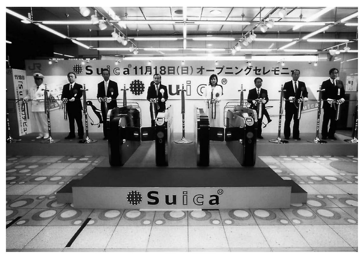
Ceremony commemorating the start of SUICA service