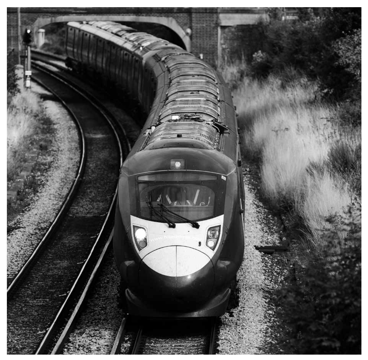
UK's Class 395 high-speed commuter train