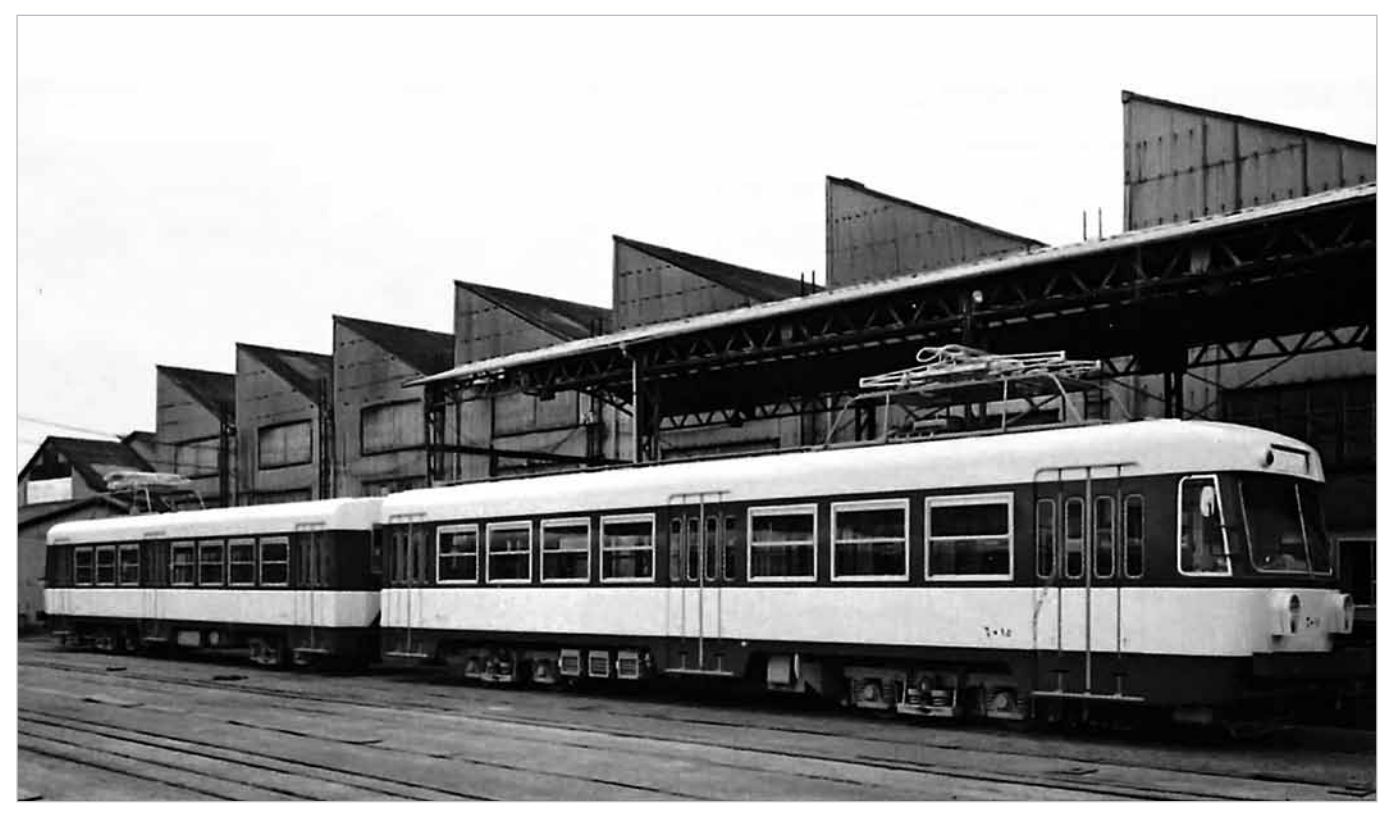
Tram for CTA in Egypt