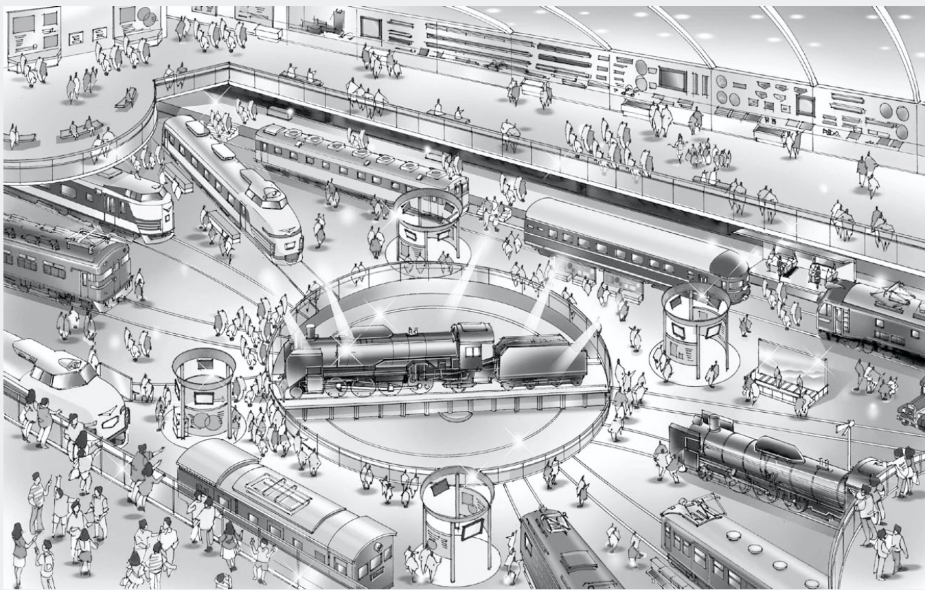
Image of a History Zone

The Transportation Museum will be closed in May 2006 and the non-railway collections will be lent to other museums. ■