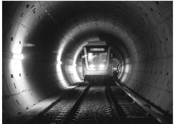
EPBM Tunnel between Konak and Basmane stations

(Yapi Merkezi Construction and Industry)