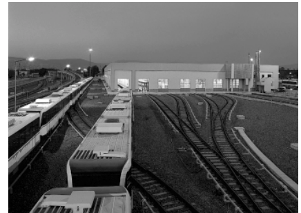
Workshop area between Halkapinar and Stadium stations

(Yapi Merkezi Construction and Industry)